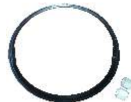
Rubber Seal & Hexagonal Bush for butterfly valve