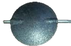
Disc for butterfly valve