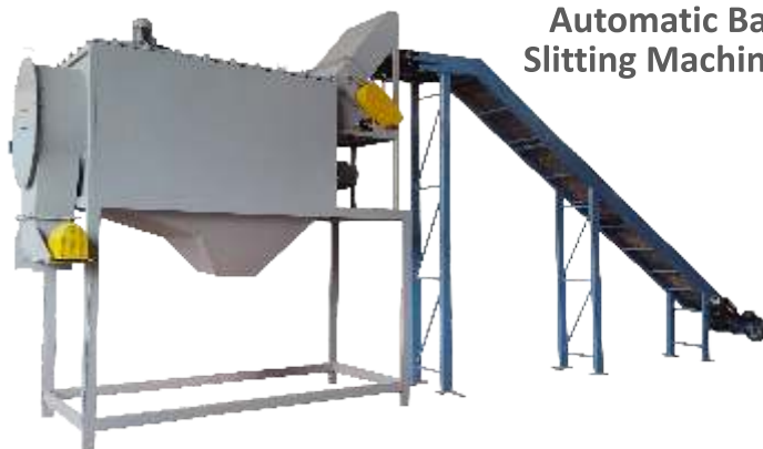
Automatic Bag Slitting Machine