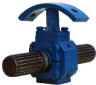
Hanger Bearings for Flyash screw conveyor