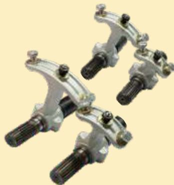
Hanger Bearings for Cement screw conveyor