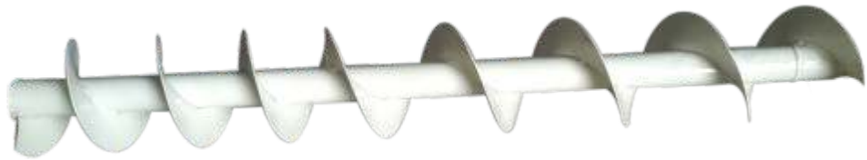
Internal Screw for screw conveyor