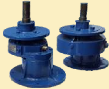
Gear Box for screw conveyor