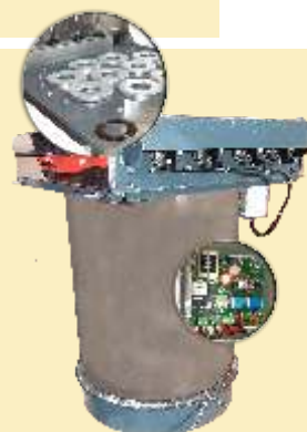
Dust Collectors Top & Ground Mounted